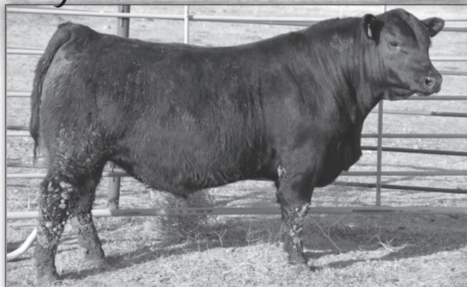
Lot 43 - Carter Signal 457