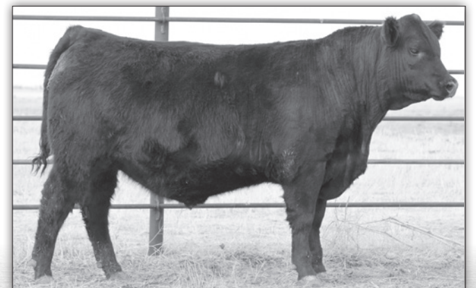
Carter Extraordinary 100H