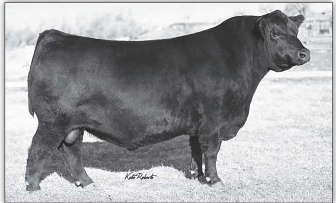
M Diamond Ranahan 111