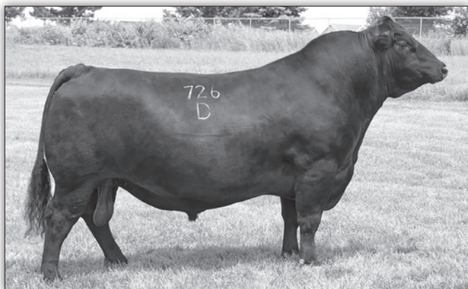
Sitz Stellar 726D

Colossal was a popular calving ease bull that is know for siring moderate progeny with excellent feet and added muscle and dimension. His daughters have nice tidy udders and added fleshing and fertility. He is a balanced sire across the board and sires very practical cattle that will work well in difficult western environments. This is a nice sire group.