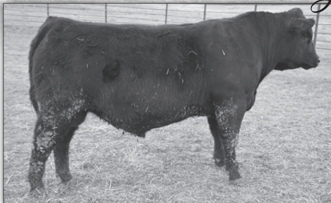
Lot 40 - Carter Signal 457