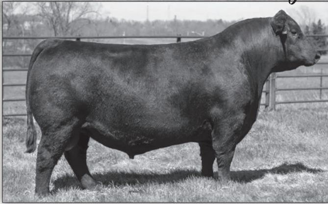
Krays Big Country 0179