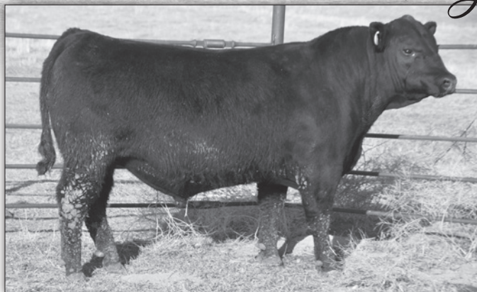
Lot 34 - Carter Extraordinary 406