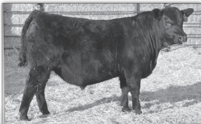
Carter Signal 1381

Patriarch has been a reliable standby calving-ease sire for the last several years. With almost 10,000 calves recorded he has seen heavy use. His progeny offer sure fire calving ease without sacrificing growth. They are solid for HP and $M and are very balanced for carcass traits. We don't have a lot of these in the sale but there are a couple that are great herd bull candidates.