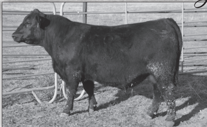
Lot 1 - Carter Patriarch 417