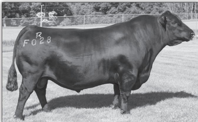
Tehama Patriarch F028

Stellar has been one of the heaviest used sires in the breed over the last few years with over 13,000 calves recorded for Birth weight. His sons are stout and are wide based with added muscle and good feet. He is a great PAP bull and his daughters have really nice udders. This will probably be our last set of Stellar sons.