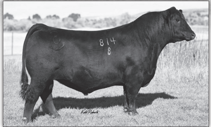
Sitz Logo 8148