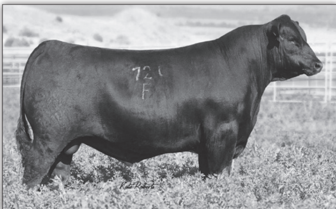
Sitz Accomplishment 720F

Essential is a bull we originally used as a calving-ease sire, but he has proven to be more of a power bull that a calving-ease bull. The calves are really stout with added middle, muscle and performance. They are moderate and wide based. He is very good for Heifer Preg and a very solid PAP sire. His daughters are soft made easy fleshing cows with nice udders.