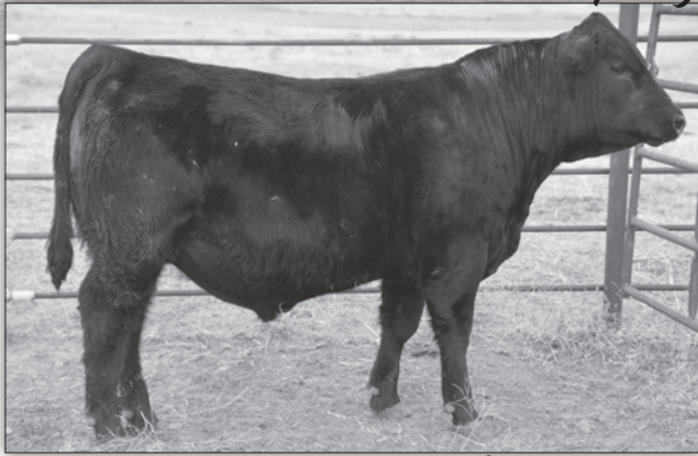
Lot 78 - Carter Patriarch 78M