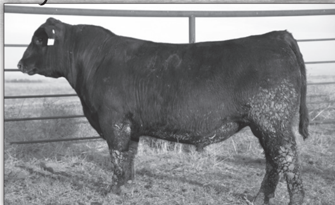
Lot 11 - Carter Abundance 435