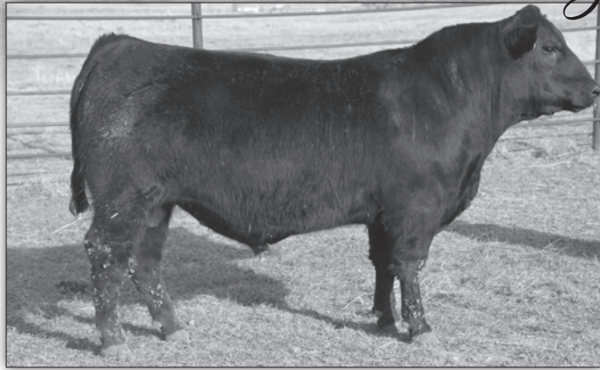
Lot 27 - Carter Logo 428