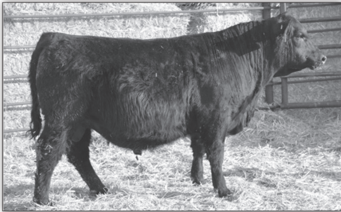
Carter Abundance 741

With over 1300 calves in his proof, Big Country has been widely accepted across the country. His progeny are structurally correct, good footed and they have great dispositions. He sires added spine length and great eye appeal. He is in the top 10% of the breed for weaning growth. He has over 100 daughters in production that are indexing 101. They have nice udders and good fertility.