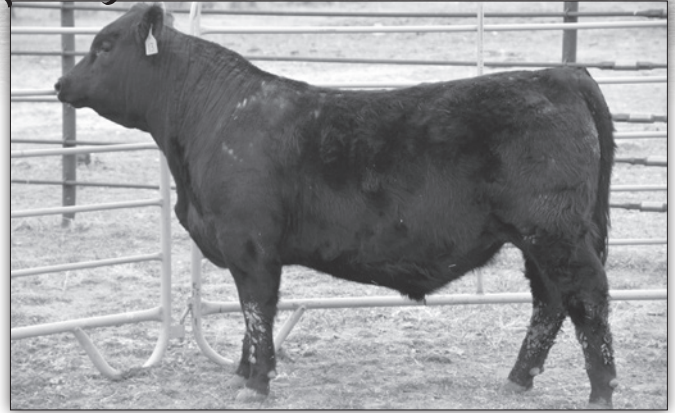
Lot 88 - Carter Big Country 13M