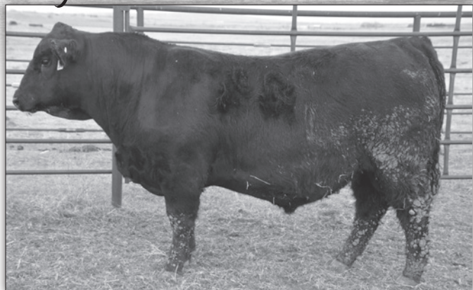
Lot 4 - Carter Logo 425