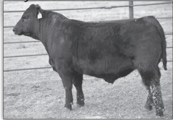
Lot 81 - Carter Extraordinary 36M

Top 15% weaning, top 10% yearling, top 4% claw, top 10% PAP, top 20% REA. Pathfinder dam has 6 calves average weaning ratio 108 while maintaining a 355 day calving interval. Dam is a maternal sister to Carter Abundance