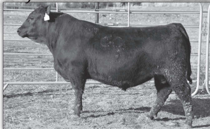
Lot 37 - Carter Stellar 456