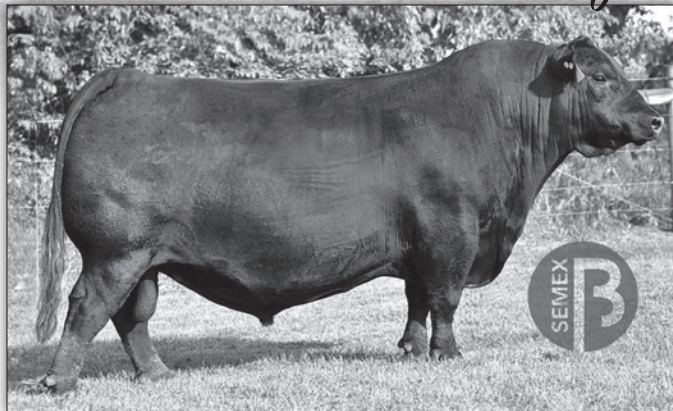
Musgrave 316 Colossal 137