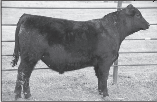
Lot 71 - Carter Essential 50M