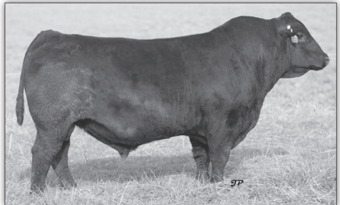
S M C Elevate