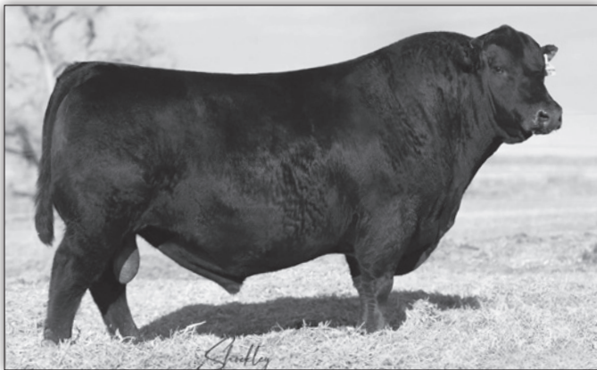
A A R Essential

Abundance is a Steller son out of a Pathfinder Lightning daughters. He is the 4th best bull in the breed for PAP. He sires moderate birth weight with above average growth. He excels for the maternal traits, being in the top 10% of the breed for HP, $M and teats as well as top 2% for udders and top 4% for Functional Longevity. His progeny are attractive and have added muscle shape.